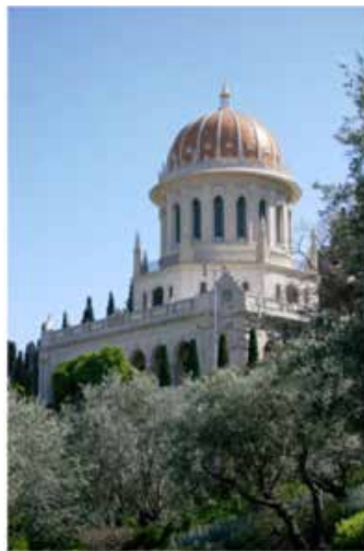
Shrine of the Báb in Haifa, Israel

tion of God. He donned the title Baha'u'llah (the glory of Allah). With that, he declared himself to be both the coming prophet of Islam (the Mahdi), the Maiytrea (from Buddhism), the Krishna (from Hinduism), and the Second Coming of Christ. Hence the inclusiveness of the Baha'i faith. When Baha'u'llah died, he was initially succeeded by his son and then a great-grandson. Today, the religion is led by the "Universal House of Justice," a group that gives annual conferences in Haifa, Israel, where the Bab's remains were buried after taken from Iran.